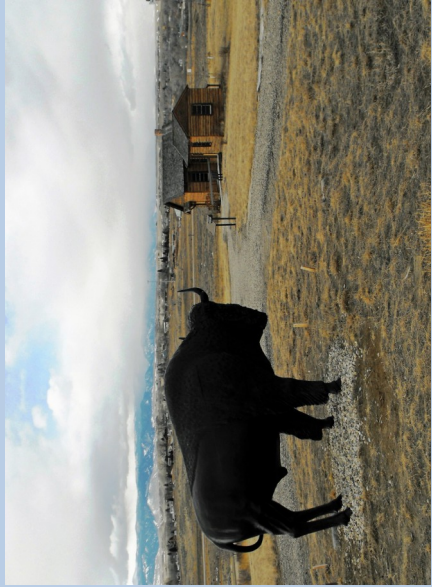
Mountain Plains Heritage Park Trail