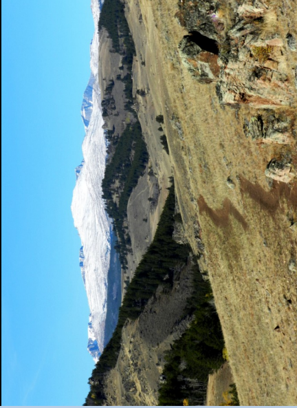
Grouse Mountain Trail

While in the Buffalo area enjoying the Clear Creek Trail System, we invite you to stay a while to visit the many famous historical sites, enjoy the spectacular scenery and take advantage of the many sporting opportunities. Learn about the culture and conflicts of the Plains Indians and revisit western history at the Jim Gatchell Memorial Museum. Walk along the famous Bozeman Trail as did the gold seekers in the 1860s. Get west-ern...feast at our great local restaurants, and Bed down beneath the Bighorn Mountains at one of our excellent hotels, motels or campgrounds.